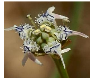
FLOWER OF NIGELLA NIGELLASTRUM

An accident that occurred on a construction site of the municipality destroyed 1 plant of Garidelle (Nigella nigellastrum), a rare species on the national red list of plants to be protected. In order to restore this damage, voluntary farmers could participate to a fertilizers reduction program in favour of green manure/leguminous to recreate a favourable environment for Garidelle . Each farmer could commit with a monetary reward of 300€/ha/year.