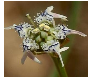
FLOWER OF NIGELLA NIGELLASTRUM

An accident that occurred on a construction site of the municipality destroyed 1 plant of Garidelle (Nigella nigellastrum), a rare species on the national red list of plants to be protected. In order to restore this damage, voluntary farmers could participate to a fertilizers reduction program in favour of green manure/leguminous to recreate a favourable environment for Garidelle . Each farmer could commit with a monetary reward of 300€/ha/year.